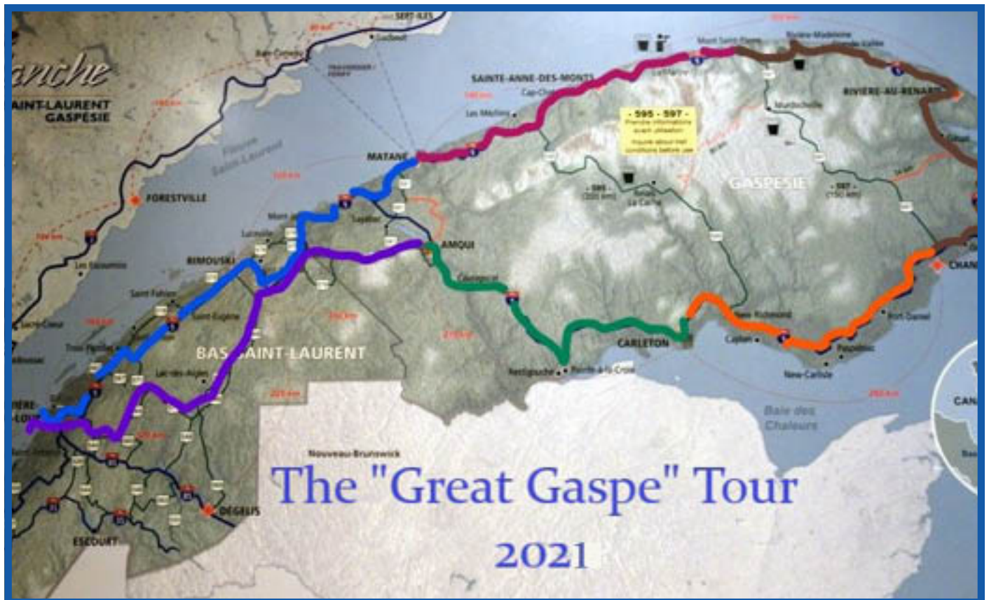
TRAIL MAP OF ROUTE