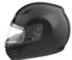
Full Face w/Electric Shield: Additional Charge