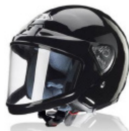
Open Face: Included