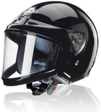
Open face - included