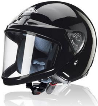
Open face - included