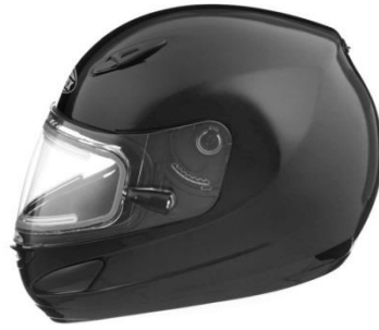
Full face with electric shield Additional charge