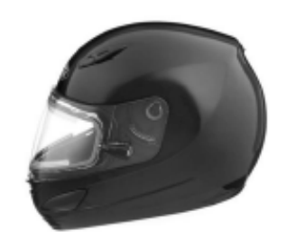
Full Face w/Electric Shield: Additional Charge