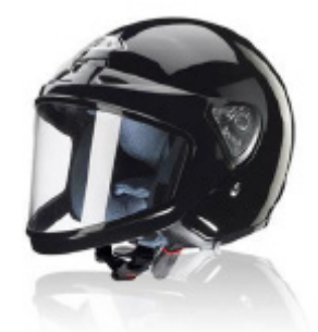
Open Face: Included